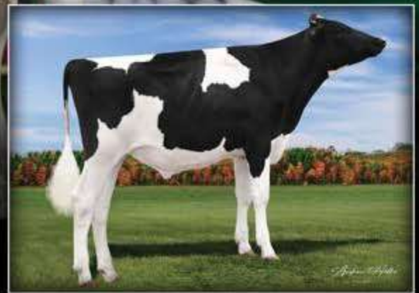
D2 SUMMERFEST CAUGHTUP +3.04 TYPE +2.45 UDC +399MILK (DEC 2022)