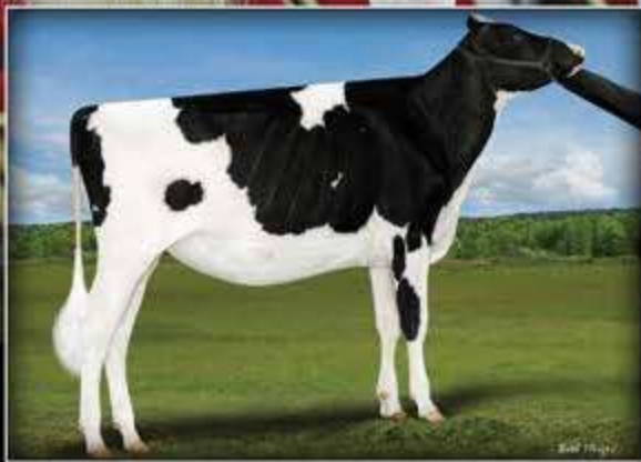
D2 SUMMERFEST EYES ON YOU HM Jr. Champion WI Championship Show 2022 FULL SISTER TO CAUGHTUP

DAM OF CAUGHTUP LADYROSE CAUGHT YOUR EYE EX-92-3YR (MAX) 1st Junior 3-Year-Old, WDE 2022 Unanimous All-American Jr 2