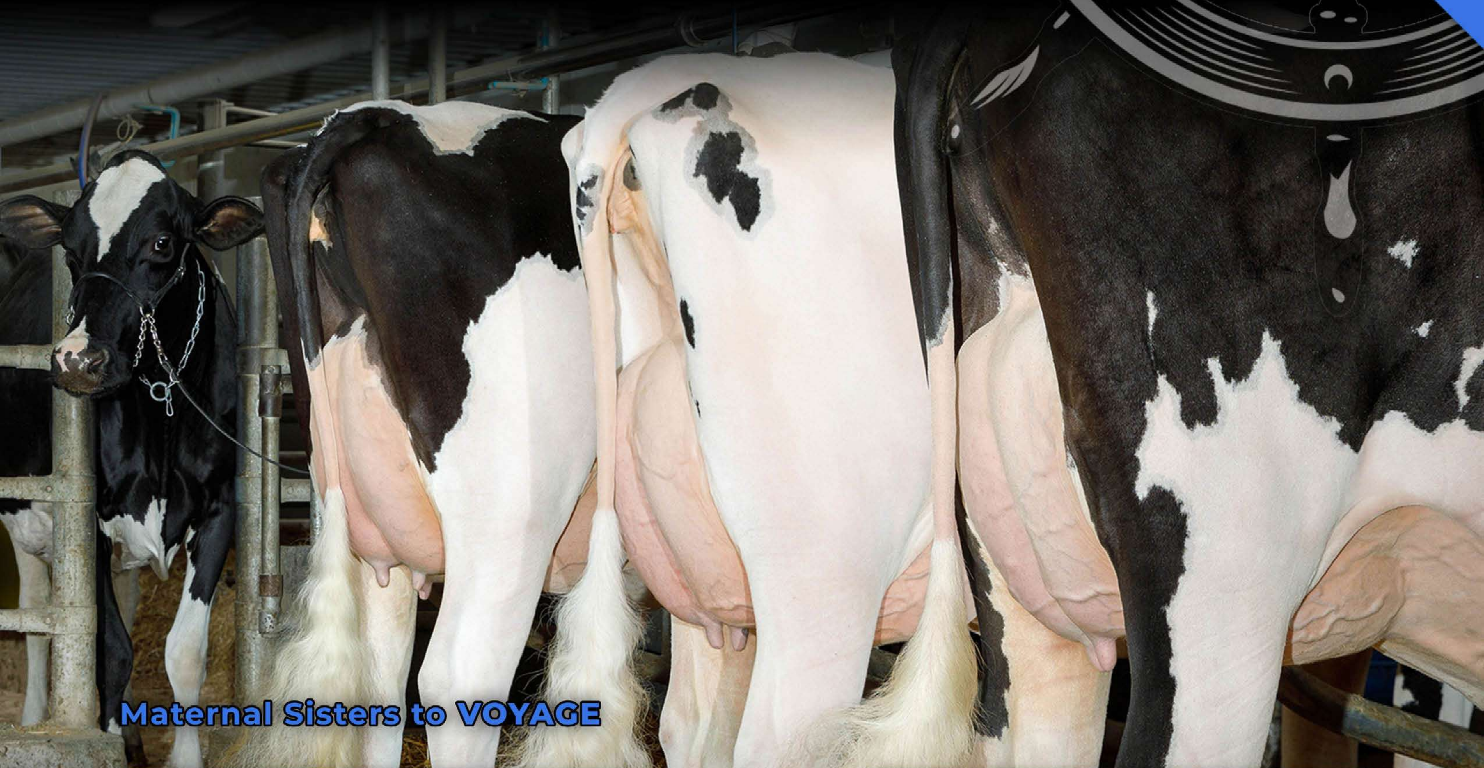
Maternal Sisters to VOYAGE

✓ LAMBDA x MS BEAUTYS BLACK VELVET EX-95-2E